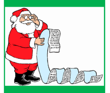
Christmas Day 25th December. 2019

22nd February Founders Day at Rowallan Park