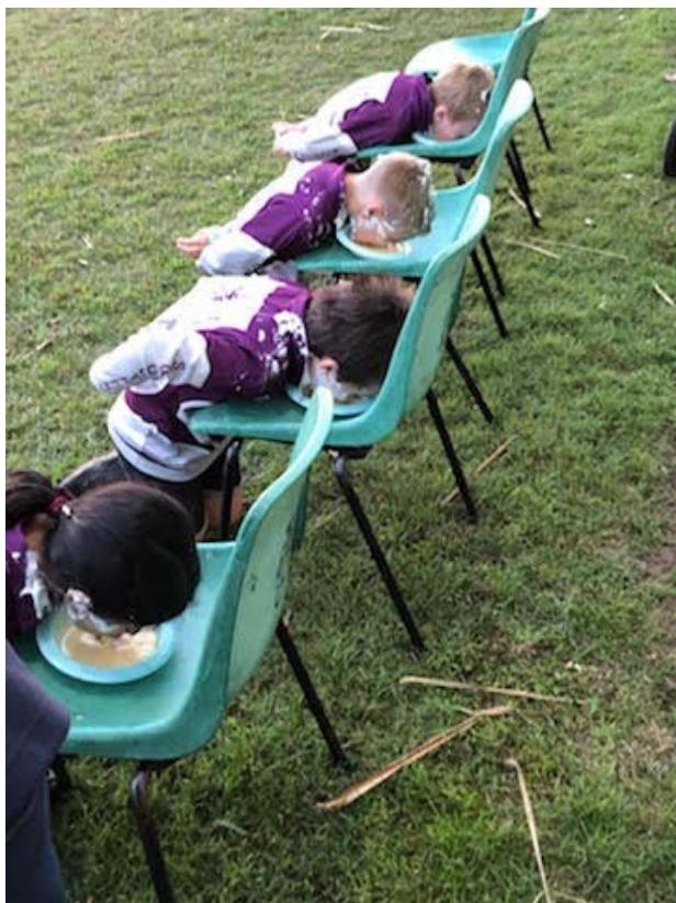
Mackay City Central Joey Scouts visited Maccas for a feed.