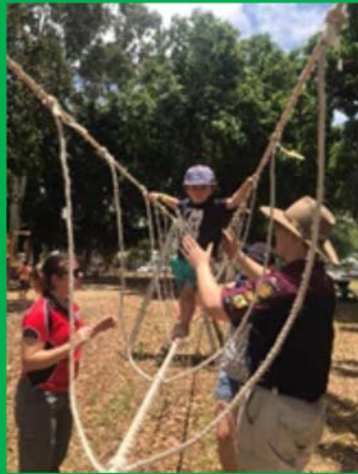
Rope Bridge Australia Day Open Day Banksia Scout Group