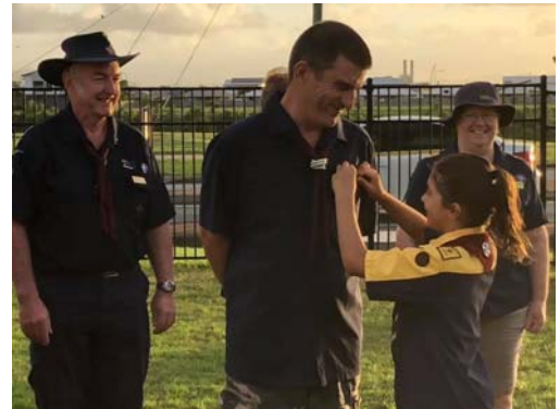
Welcome to the New Leader.